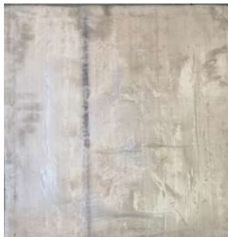
No penetration (max. 835 m/s)