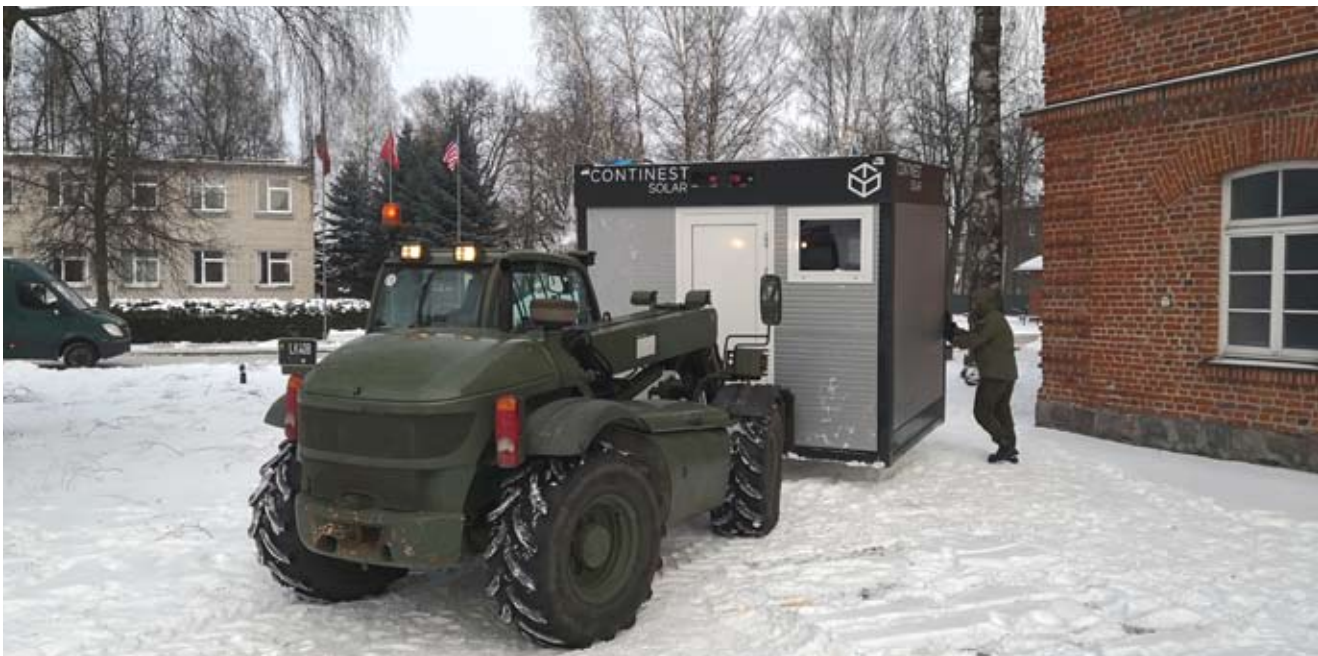
CN SU10 solar-prototyping 1 is ongoing Field Evaluation in Lithuania since 7 January 2019.